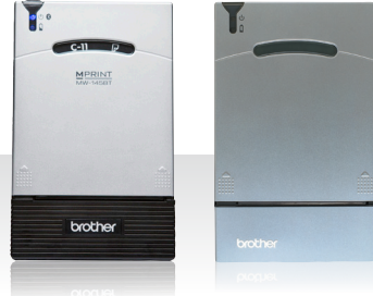
MW-140BT / MW-145BT